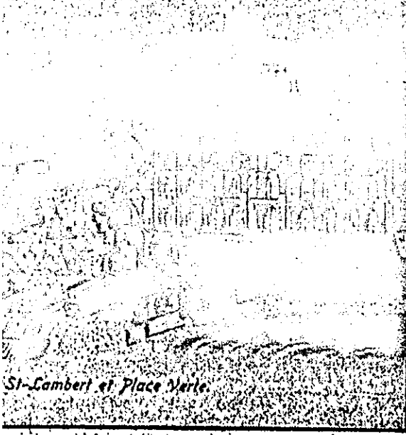
St-Cambert et Place Verte

the Kaiser's troops, but whose nearby forts are mostly by the Belgian defenders.